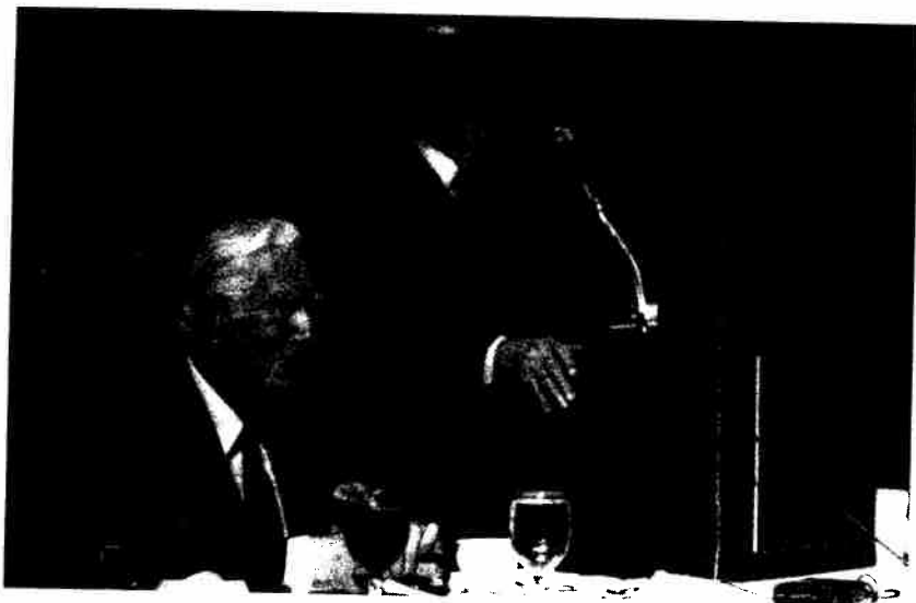
FORMER U.S. ATTORNEY GENERAL HERBERT BROWNELL INTRODUCING HIS GOOD FRIEND AND FORMER ASSISTANT, CHIEF JUSTICE WARREN E. BURGER(RET.) AT THE CENTER'S 22ND ANNUAL LEADERSHIP CONFERENCE, RICHMOND, VIRGINIA